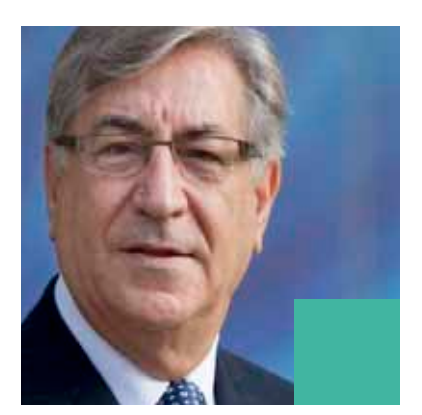
Karmenu Vella European Commissioner for Environment, Maritime Affairs and Fisheries

Additionally, the Port of Amsterdam supports many other offshore activities, e.g. the development of the North Sea in a sustainable, responsible, and cost-effective way for renewable industry. Finally, I can say that we are devoted to the ROC Nova College initiative of launching the Wind Technician vocational technical education, which includes Falck training (offshore safety training), and Quercus (high voltage training).